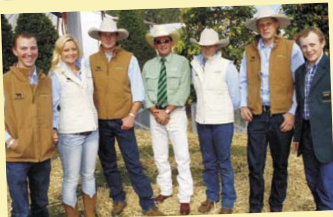
Landmark Angus Youth Ambassadors