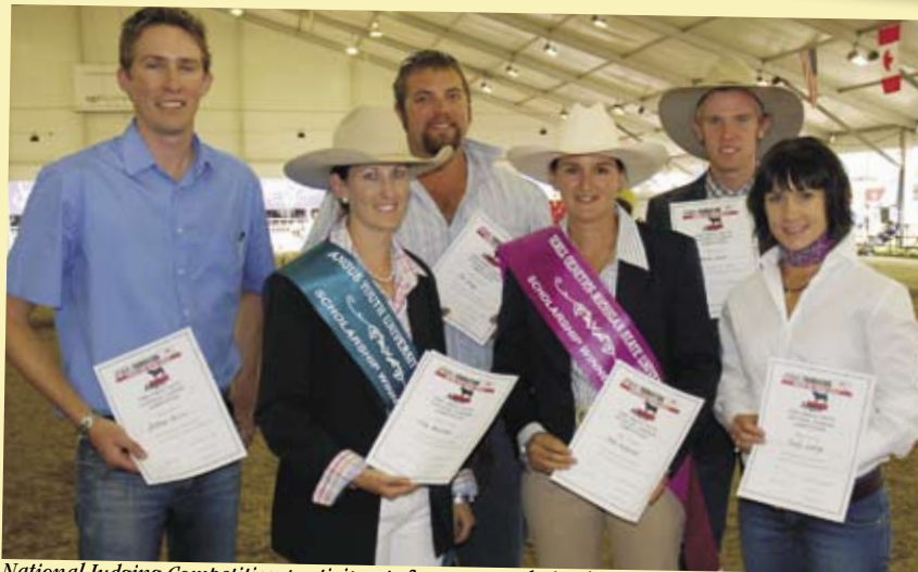
National Judging Competition participants & overseas scholarship winners