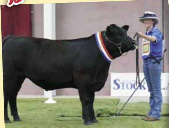
Parading to Angus Youth Roundup - Cattle Judging