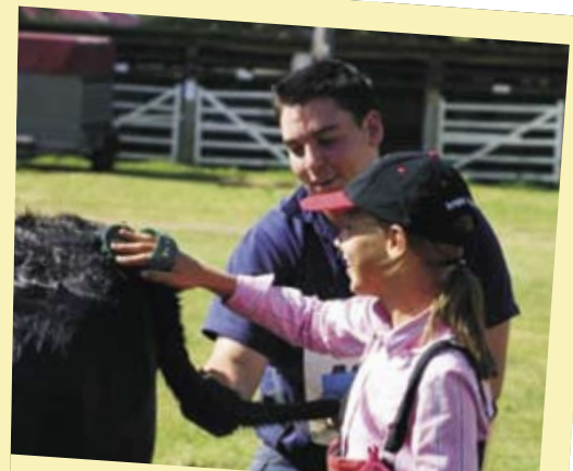
Educating others—sharing experience