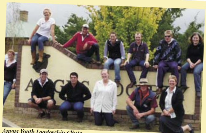
Angus Youth Leadership Clinic